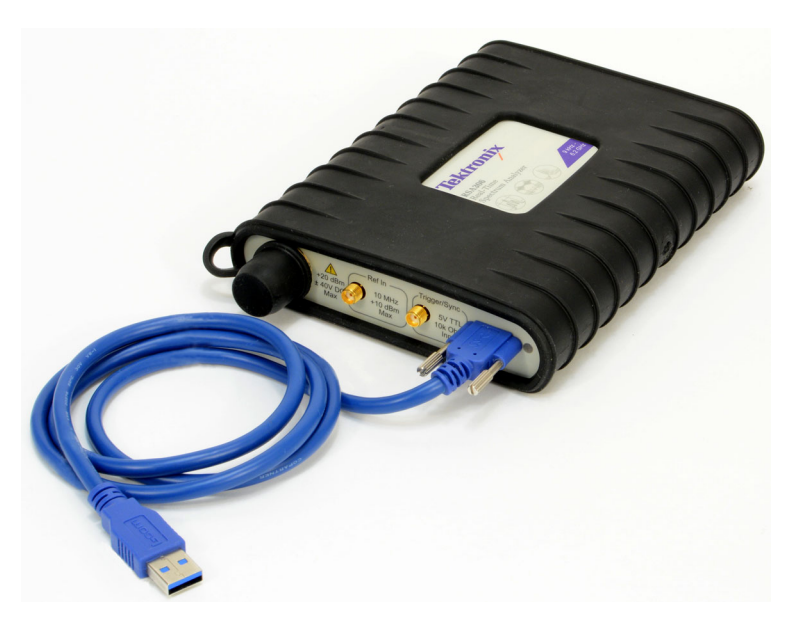
Figure 1: RSA306 Real-Time Spectrum Analyzer

The RSA306 is a portable, 40 MHz Real-Time Spectrum Analyzer that contains an acquisition system inside a small module. The user interface and display resides on a user-provided PC running SignalVu-PC software or a user-developed application. The host PC provides all power, control, and data signals over the USB 3.0 cable included with the instrument. An available SW API is provided to allow you to create your own custom signal processing application.